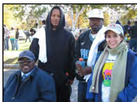
Homeless Walk 2007