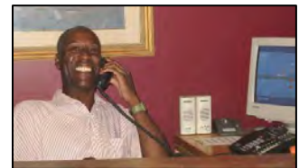
Front Desk Volunteer