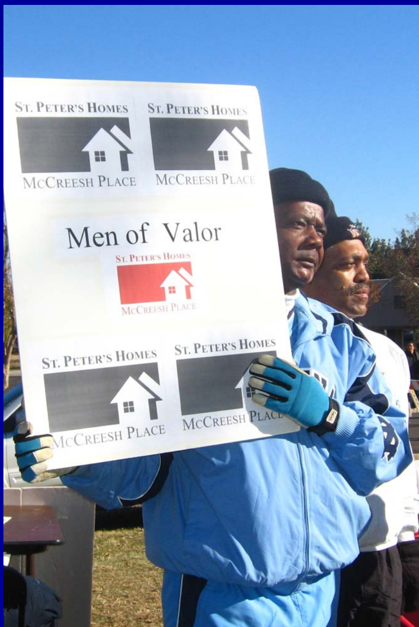
McCreech Place residents and volunteers participate in the 2008 Homeless Awareness Walk